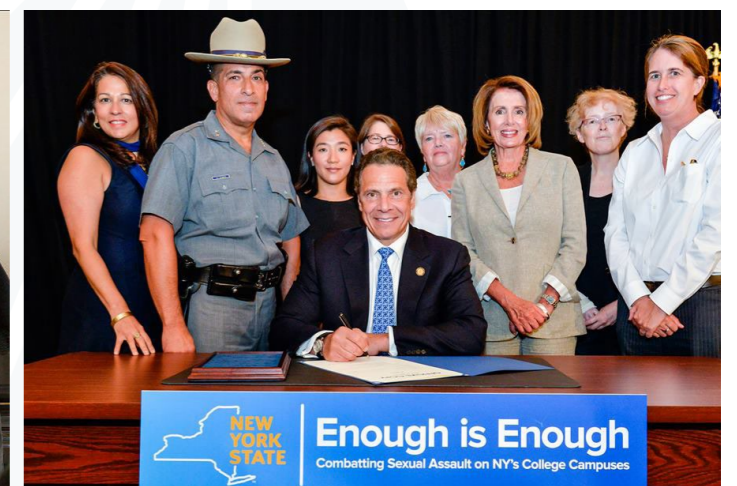
Enough is Enough Governor