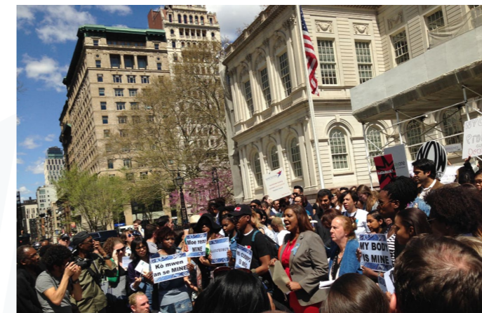
Denim Day 2015

The Alliance hosted its happy hour and live art show in collaboration with Collage Movement and the DL at the DL Rooftop. The night was filled with beautiful art, interesting people, and also paid homage to iconic feminists throughout history. It raised awareness around the prevalence of sexual assault in New York City and the role strong feminists have in social change. This year the Alliance raised over $1,000 through the event.