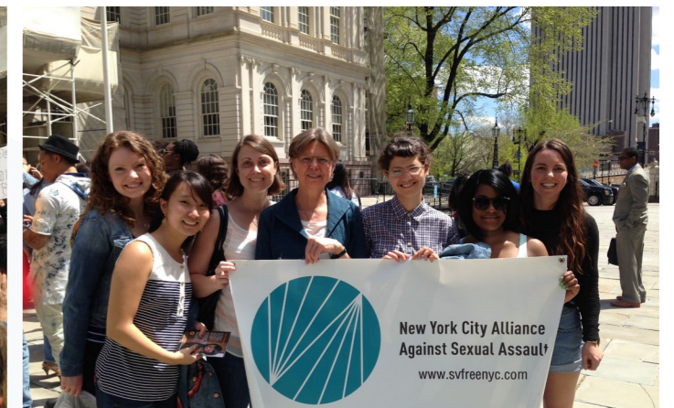
Denim Day 2015- Staff